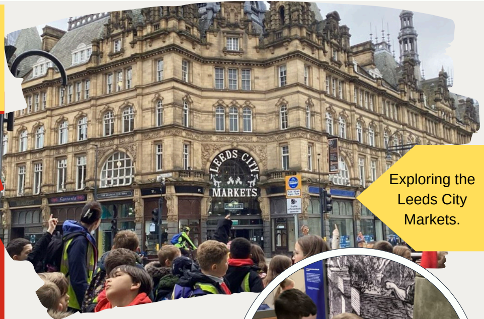
Exploring the Leeds City Markets.

Last week Y4 had their first trip to Leeds. We mapped out the route to Millennium Square and looked at the key buildings before sketching them. Next we went to the Leeds City Museum and saw lots of artefacts, such as early Stone Age farming tools.